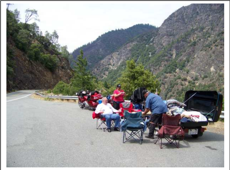
Lunch on Hwy 299, between Redding & Eureka

Mt. Shasta was the stop for the night. Tuesday we rode south on I-5 to Redding, then west on Hwy 299 and Eureka on the coast.