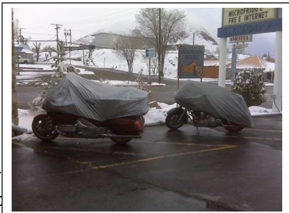
Our bikes in Tonopah, NV tucked away for the night!

After a good night’s sleep, we awoke on Wednesday morning to 2-3 inches of snow on the car roofs outside of our room’s window. Luckily, the parking lot and streets were clear of snow. This time we put our Frogg Toggs on inside the motel room where it was warm and dry. While the US 50 to the east was clear of snow, the surrounding countryside was a solid white. We encountered several snow flurries on our travel to Ely, NV where we had lunch. Ely is where we left US 50 and we headed south so we could pick up NV 375, the Extraterrestrial Highway and stop at the Little A’Le Inn in Rachel, NV. The town of Rachel is not much more than a wide spot in the road and the Little A’Le Inn is a little bar with a “little green man” looking out the window. So, after a quick soda, we were off heading towards our night’s lodging in Tonopah, NV. However, 10-20 miles after leaving Rachel, we rode in to a snowstorm. No little flurries this time, but an honest to goodness snow storm. Luckily, it the snow didn’t stick as the pavement was still warm. The storm lasted about 20 miles on a state highway in Open Range country. We not only had the snow to contend with but twice we had to stop so cows, calves, and steers would get out of our way. When we got into Tonopah, NV, it was 30 degrees and while the roads were clear, the yards, parked cars, and trees were covered in 6-12 inches of snow. The motel was a welcome site.