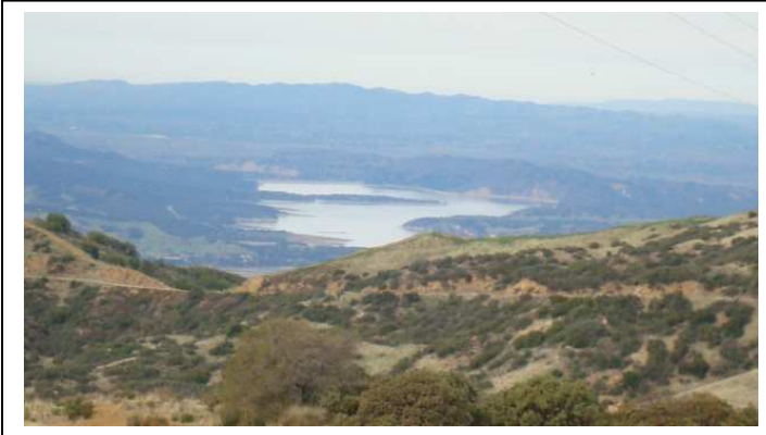
View of Lake Cachuma from atop E. Camino Cielo.

We took E. Camino Cielo Rd. to SR-154 where we stopped to take a rest break at the dam overlook of Lake Cachuma. We commented about how nice it was to see the mountains green again from recent rains. As we stretched our muscles, we could hear gunfire from a nearby ranch. Obviously some people playing with their new toys they got for Christmas.