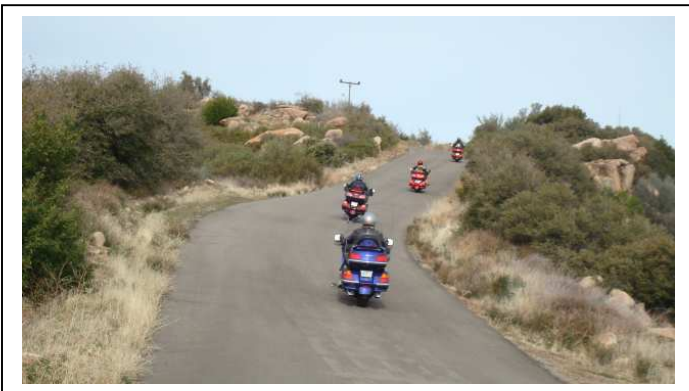
Cruising along the new asphalt on E. Camino Cielo.

Here we are at the beginning of a new riding decade. The first breakfast ride is destined to “Jalama Beach Grill” near Lompoc. It starts early on the morning of January 9 of the year 2010. Our Chapter meets at the “Main Street” Restaurant at 8am sharp. Thirteen people for breakfast make a good start for the decade. Business was carried on during the meal and Walt was the grand winner of the 50/50. Out of the group, only six of us would be brave enough to trudge though the pleasant temperatures and partly cloudy Southern California day. As we left Ventura heading north on the 101 with a detour via Highway 1 along the Rincon, we exited at Sheffield Dr. We then took Sheffield north to E. Valley Rd. (also SR-192). We took SR-192 northerly to El Cielito Rd. Turned right on El Cielito Rd to Gibraltar Rd. Turned right on Gibraltar Rd. to E. Camino Cielo Rd. The road was in good shape mostly with new asphalt but there where some areas where you had to chose which pothole to hit.