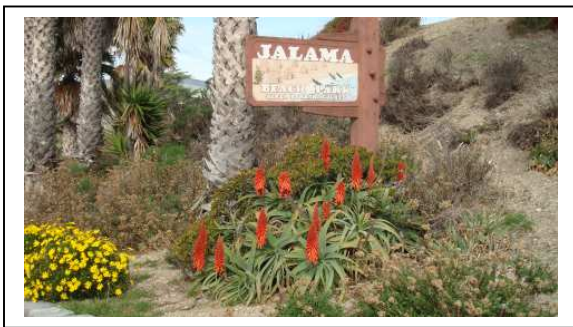
Entrance to Jalama Beach Park.

We proceeded onto SR-1 to Jalama Rd. and on into Jalama Beach campground. As we pulled in at the grill there was three Goldwings already there.