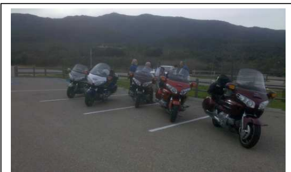
Rest Break at the Overlook.

We took E. Camino Cielo Rd. to SR-154 where we stopped to take a rest break at the dam overlook of Lake Cachuma. We commented about how nice it was to see the mountains green again from recent rains. As we stretched our muscles, we could hear gunfire from a nearby ranch. Obviously some people playing with their new toys they got for Christmas.