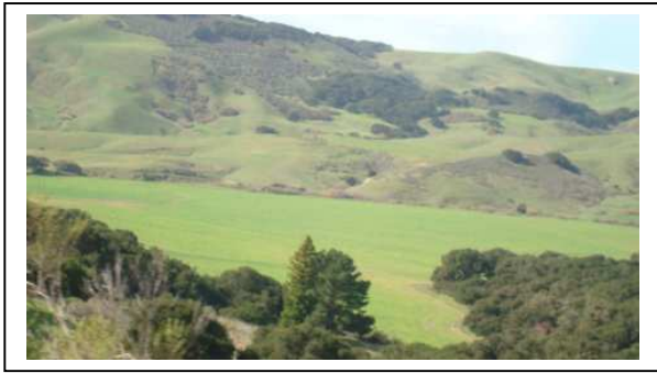
Green pastures along Jalama Rd.

We then continued on SR-154 to Ballard Canyon Rd., taking Ballard Canyon Rd. south to SR-246. Turned west on SR-246 to Lompoc where we refilled our gas tanks.